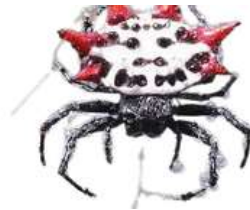
Spiney-back ORB Weaver