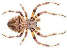
Garden ORB Weaver

Most of us are not fond of spiders but they help to balance our ecosystem. In addition, spiders benefit our wildlife by creating a complex food chain. For one thing spiders help control insect populations. For example, the Garden ORB Weavers are spiders known for being skilled at producing webs that will keep certain insect populations from getting too high. These non-aggressive spiders can be found in your garden. Then there is the Spiney-backed Orb Weaver that keeps mosquito populations down by catching them in their webs. A bite from the spider is not known to cause serious harm to humans. The Golden Silk Orb Weaver also controls insect populations. This is one of the largest spiders in the U.S. that creates a beautiful golden web.