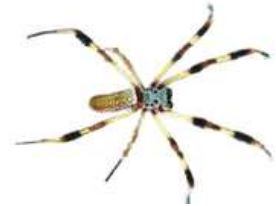
Golden Silk ORB Weaver

In addition, spiders benefit our wildlife by creating a complex food chain. They are preyed upon by birds, lizards, frogs, and even larger insects. This is how they are an important connector to the food chain. Energy and nutrients are transferred between different levels.